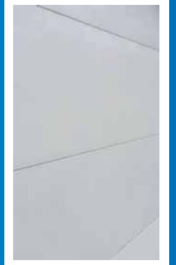
Flatline Smooth .8 Profile