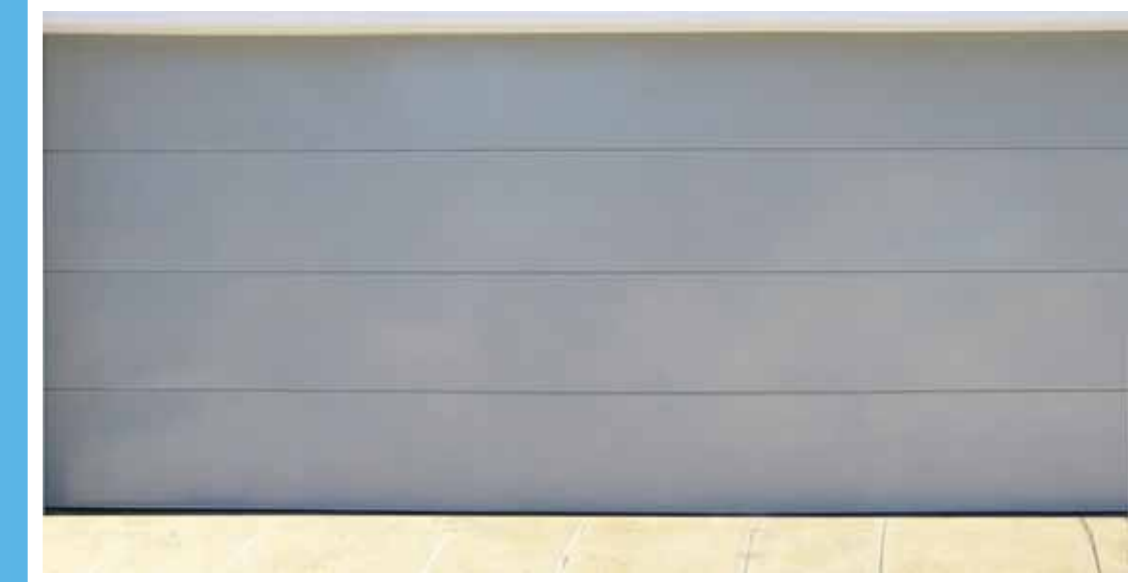
▲ FLATLINE SMOOTH .8 Sectional Door