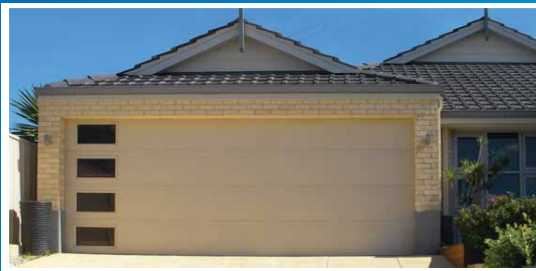
▲ FINELINE Sectional Door with plain vertical window