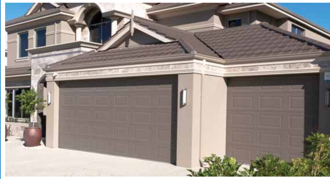
▲ PRESSED PANEL Sectional Door

There are four Standard Sectional Doors available which include: Pressed Panel, Ribline, Fineline and Flatline 0.6 Embossed profiles. They are manufactured from BlueScope Colorbond Steel, featuring custom sizing and hemmed inside edging for additional safety. Along with these features, heavy duty hardware and a reliable automatic opener will provide years of trouble free operation.