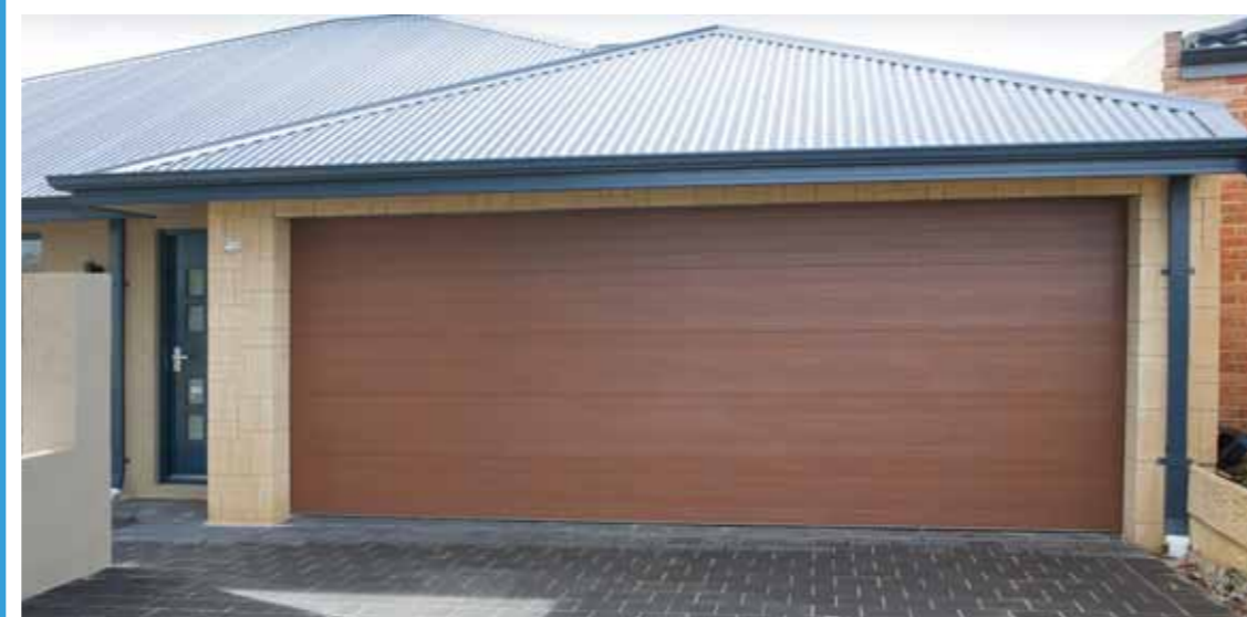
▲ NEW CEDAR FINELINE Sectional Door