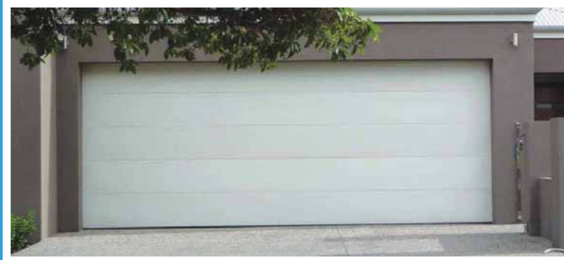
▲ FLATLINE EMBOSSED .6 Sectional Door