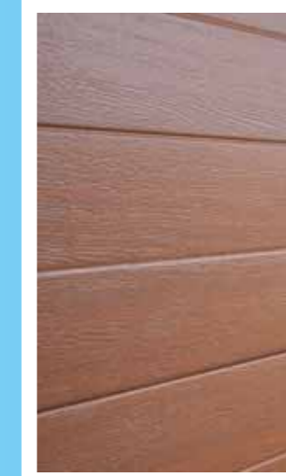
New Cedar Fineline Profile