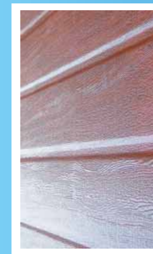
Caoba Ribline Profile