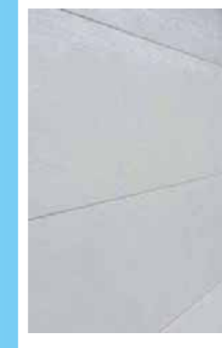
Flatline Embossed .6 Profile