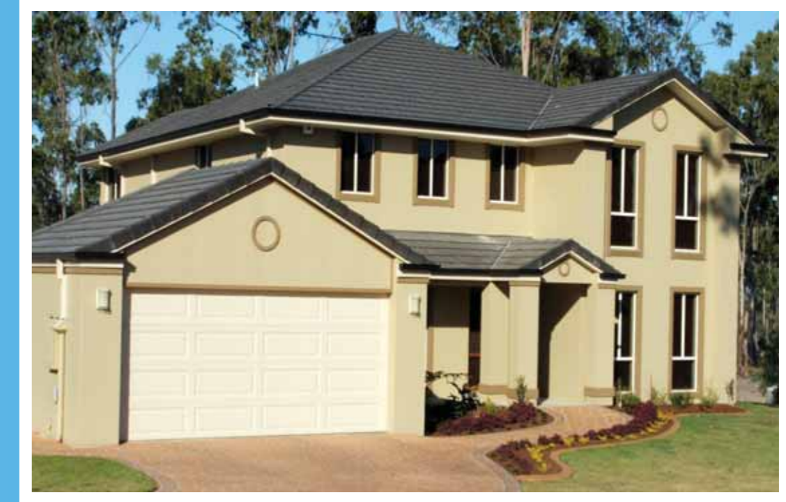
▲ RANCH PROFILE Sectional Door