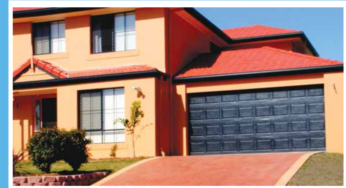
▲ HERITAGE PROFILE Sectional Door