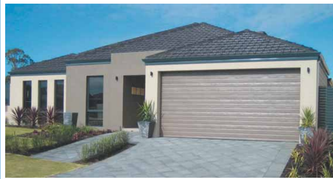
▲ RIBLINE Sectional Door

There are five non - standard Sectional Doors available which include: Timber Look doors, Flatline .8 Smooth Finish and Ranch and Heritage Profiles. The Timber Look doors are available in two tones - New Cedar Colorgrain and Caoba Colorgrain and in the following profiles: Fineline, Pressed Panel and Flatline embossed.