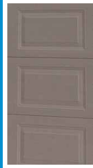
Pressed Panel Profile