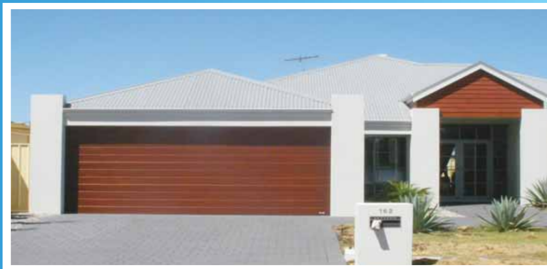
▲ CAOBA RIBLINE Sectional Door